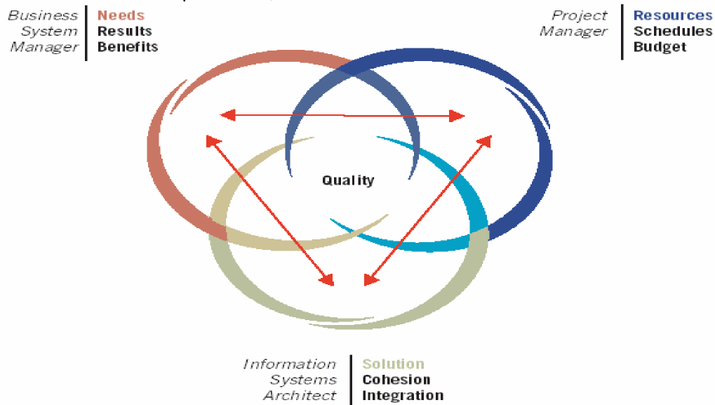
Figure 1. Perspectives in Managing a Project

The CTA Solutions project management process supports the paradigm shift of comprehensive and complete life cycle requirements to ensure "cradle-to-grave" completion using Earned Value Management principles. CTA Solutions employ PMBOK theory and best practices paired with hands-on, real-world knowledge and experience.